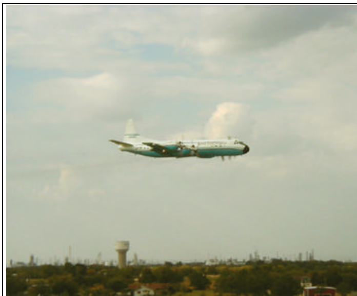
The Electra makes a low-level “missed approach” over the LaPorte Monitoring Station with the ship channel refineries in the background. These passes allow intercomparison of aircraft and surface monitoring data.