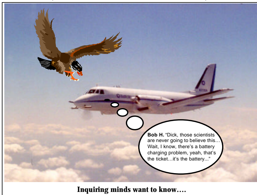
Inquiring minds want to know....

The Electra did not fly yesterday but will fly a mid-day urban/source characterization flight today. The first part of the flight - taking off at 10:30 AM and returning at 12:30 PM - will focus on the characterization of chemistry and transport over Galveston Bay and downtown Houston.