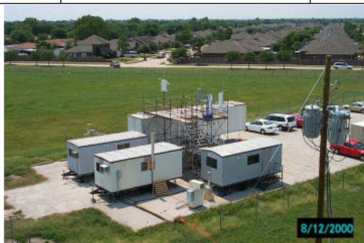
La Porte Aerosol Cluster

The G-1 flew this morning in advance of the rain. They left Ellington at 9:30 AM and returned